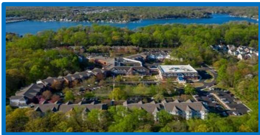
Ginger Cove at Home is Headquartered at Ginger Cove's CCRC Campus

The administrative offices of GCaH are located on the ground floor of the Heritage building which is on Ginger Cove's campus, a 30-acre beautifully wooded site on Gingerville Creek, which flows into the South River and Chesapeake Bay, just a short distance from Historic Annapolis. This location provides easy access and parking for GCaH members and prospects. Additionally, as some of the activities and events which are held at the Community will be offered to Members, its provides an opportunity for Members to become familiar with the beautiful location.