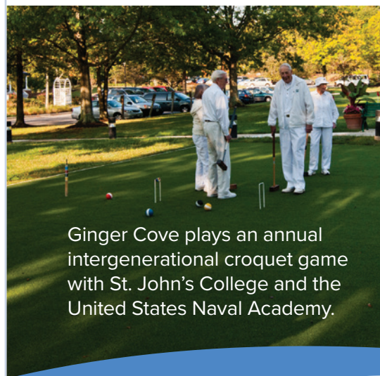
Ginger Cove plays an annual intergenerational croquet game with St. John's College and the United States Naval Academy.

Since connecting with others is part of healthy living too, you'll cheer for happy hours and friendly games of competition – croquet, bocce ball, darts, billiards and pingpong. Afterward, we'll satisfy your appetite with a delicious dining experience from our expert culinary team.