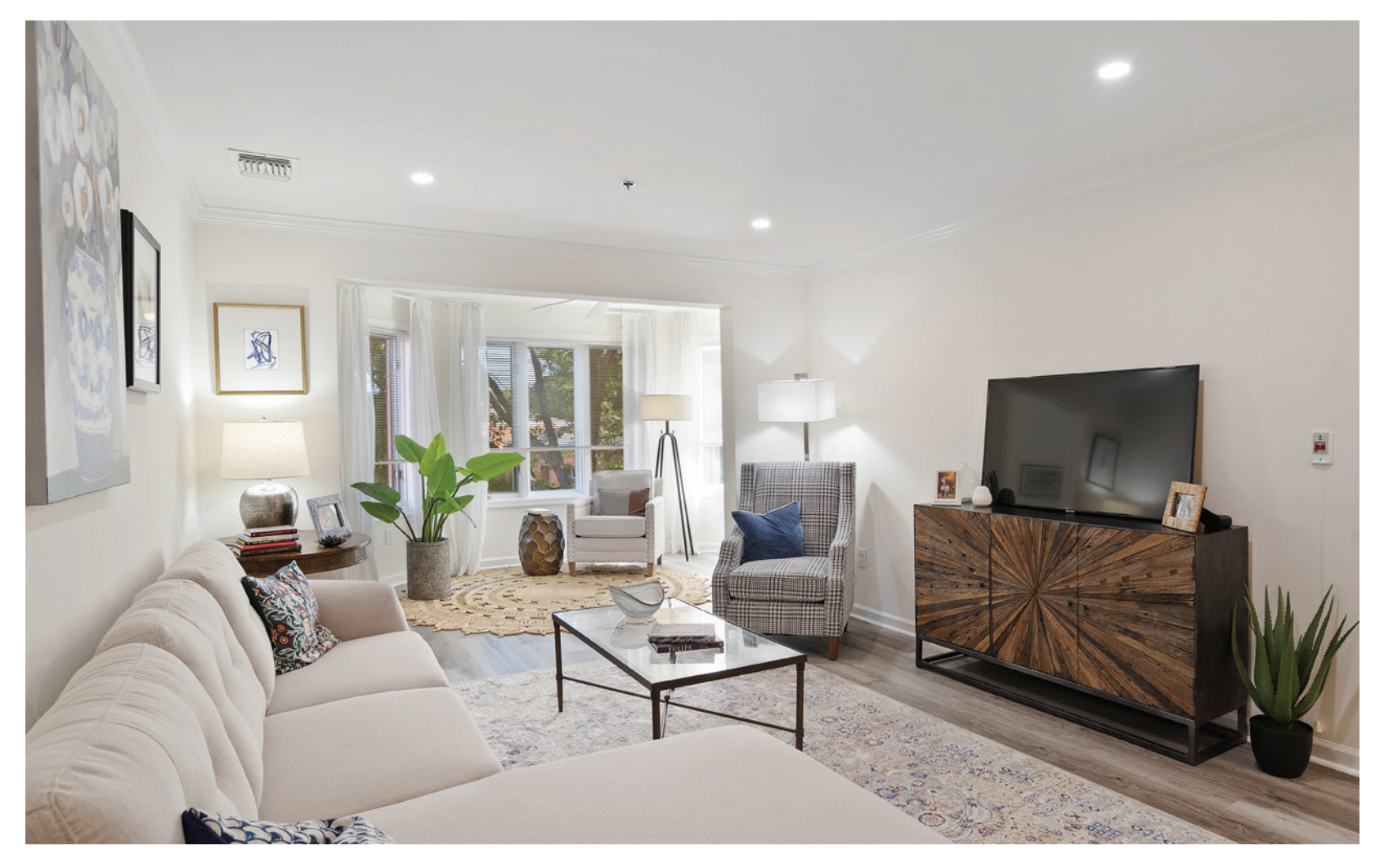
We tailor your new home to your liking with your choice of paint colors, flooring, and finishes.