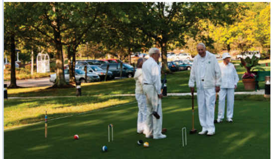
Ginger Cove plays an annual intergenerational croquet game with St. John's College and the United States Naval Academy.